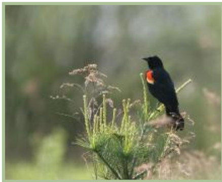
Red-winged Blackbird—Photo taken at Bald Eagle State Park—One of the best locations for birding in Central Pennsylvania

"In addition to offering recreational, educational, health and fitness benefits, the Brick Town Trail is expected to help revitalize the economies of the towns along and near it's route ~ Glenn Vernon"